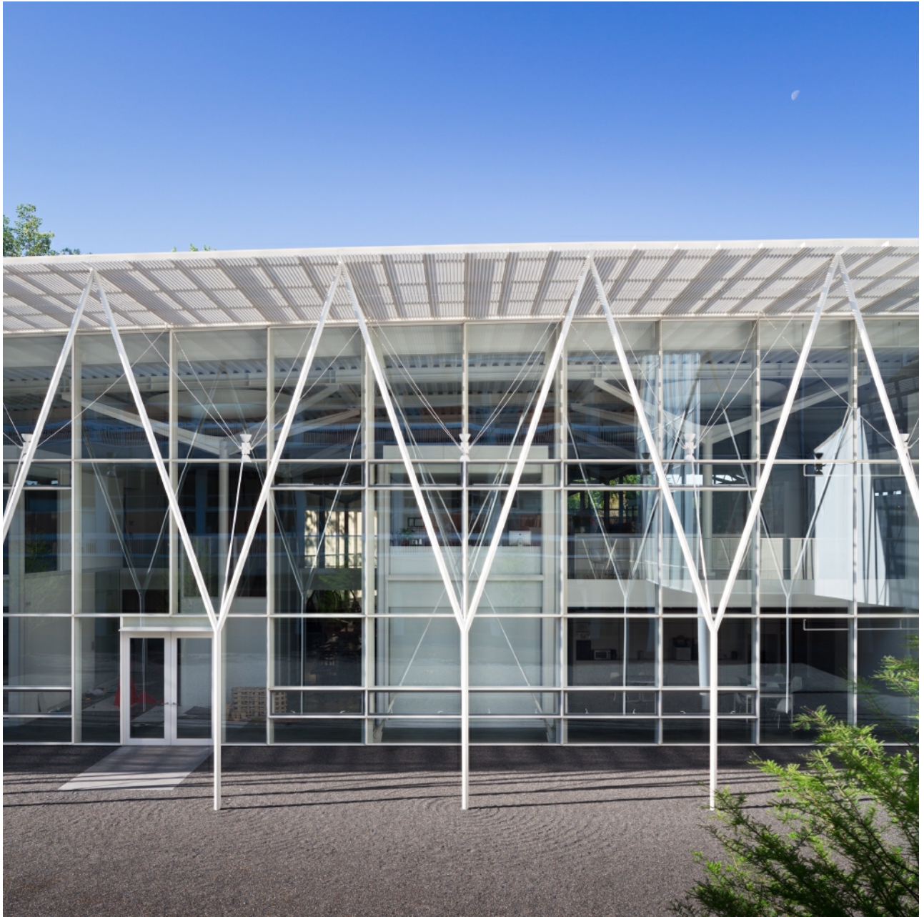
Front facade of Lee Hall.

The building's metal roof structure is supported by a forest of branched steel columns and its long, main facade is almost entirely glazed. The main facade, together with round skylights spaced across the roof and a consistently white interior finish, help to reflect daylight deep into the building.