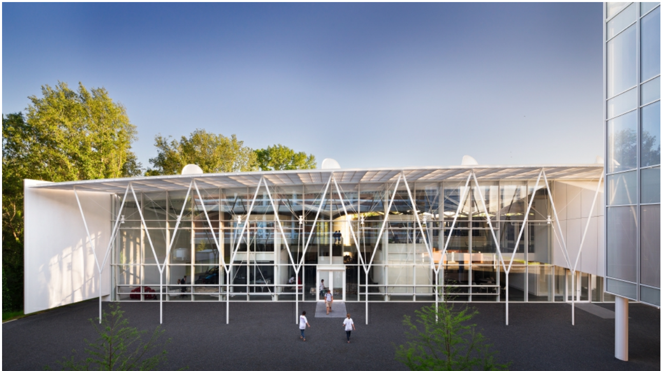
Overview of the Lee Hall College of Architecture addition.