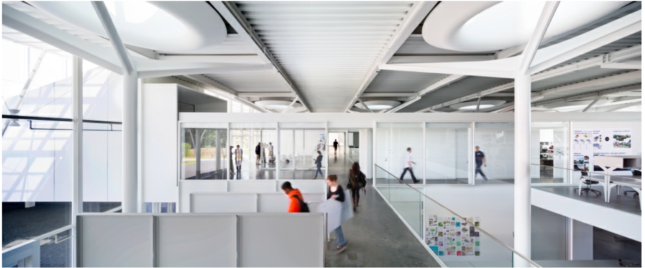
Upper-level view inside the Lee Hall addition.

"It is an exceptional work that surrounds students with a seamless integration of programmatic goals, energy efficiency, and creative tectonics."